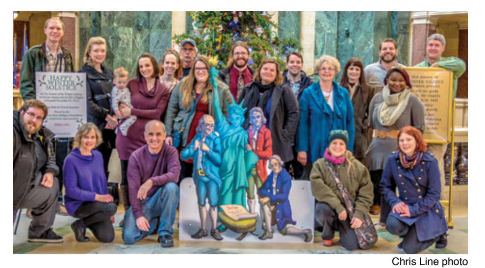
FFRF current staff photographed by solstice displays at Wisconsin capitol

property, ending the 3-year-old suit. A twin challenge in New Kensington, Pa., in which the same judge ruled a parent and high school student lacked standing to challenge a decalog in front of the high school, is on appeal.