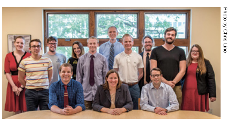
FFRF's mighty legal accomplishments - 2017