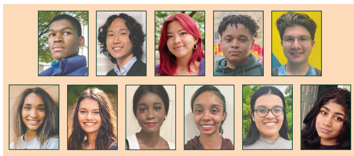
2022 BIPOC College Essay Contest winners

FFRF continues unparalleled scholarship programs for freethinking students. FFRF awarded $20,250 in prize money to 11 major winners and 18 honorable mentions in its David Hudak Memorial Black, Indigenous and Students of Color Essay Competition ; $18,350 in award money to 11 top winners and 13 honorable mentions in its Kenneth L. Proulx Memorial Essay Contest for Ongoing College Students ; $17,650 to 10 major winners and 11 honorable mentions in the Cornelius Vanderbroek Memorial Essay Contest for Grad/Older Students ; $17,850 to 10 major winners and 12 honorable mentions in its William Schulz Memorial High School Essay Contest for College-bound High School Seniors ; and $9,000 to three winners of the Diane and Stephen Uhl Memorial Law Student Essay Competition.