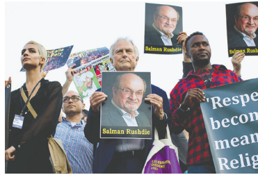
“We Dissent” conference, cosponsored by FFRF