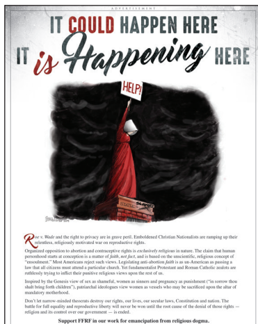
Artwork from a recent New York Times Ad, created by editorial cartoonist Steve Benson.

FFRF refreshes Ron Reagan TV ad. The national CBS network finally agreed, seven years after it was first recorded, to accept our 30-second TV spot by the obliging Ron (“unabashed atheist ... not afraid of burning in hell”) Reagan. The ad ran about a dozen times on CBS’ “The Late Show with Stephen Colbert.” We’re excited to announce that Ron’s ad has also been finally accepted to air on “60 Minutes” in the New Year. The ad ran several times this year on Comedy Central’s “The Daily Show,” TBS’ “Full Frontal with Samantha Bee” and MSNBC’s “Rachel Maddow Show.” We’re thrilled that Ron recorded a “refreshed” ad for us this year—containing the same iconic language as the original.