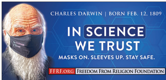
This billboard was placed in time for Darwin Day on Feb. 11, 2021.

FFRF ran print ads in The New York Times, The Nation, The Progressive and Scientific American. We placed “In Science We Trust” pandemic-related billboards in Chicago, working with our Chicago chapter, and in our hometown of Madison, Wis. In the fall, we placed billboards urging “Sleep in on Sunday” and “Enjoy life now — There is no afterlife,” targeting irresponsible megapreachers in Tennessee and Houston (that would be Joel Osteen).